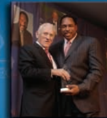
Dave Winfield accepts his award from Tom Kelly.