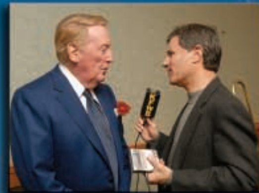
Vin Scully grants an interview prior to the dinner.