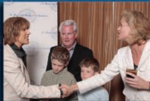
Diana Nyad speaks with dinner guests at the conclusion of the evening.