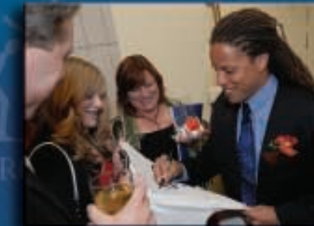
Cobi Jones graciously signs autographs for young fans.